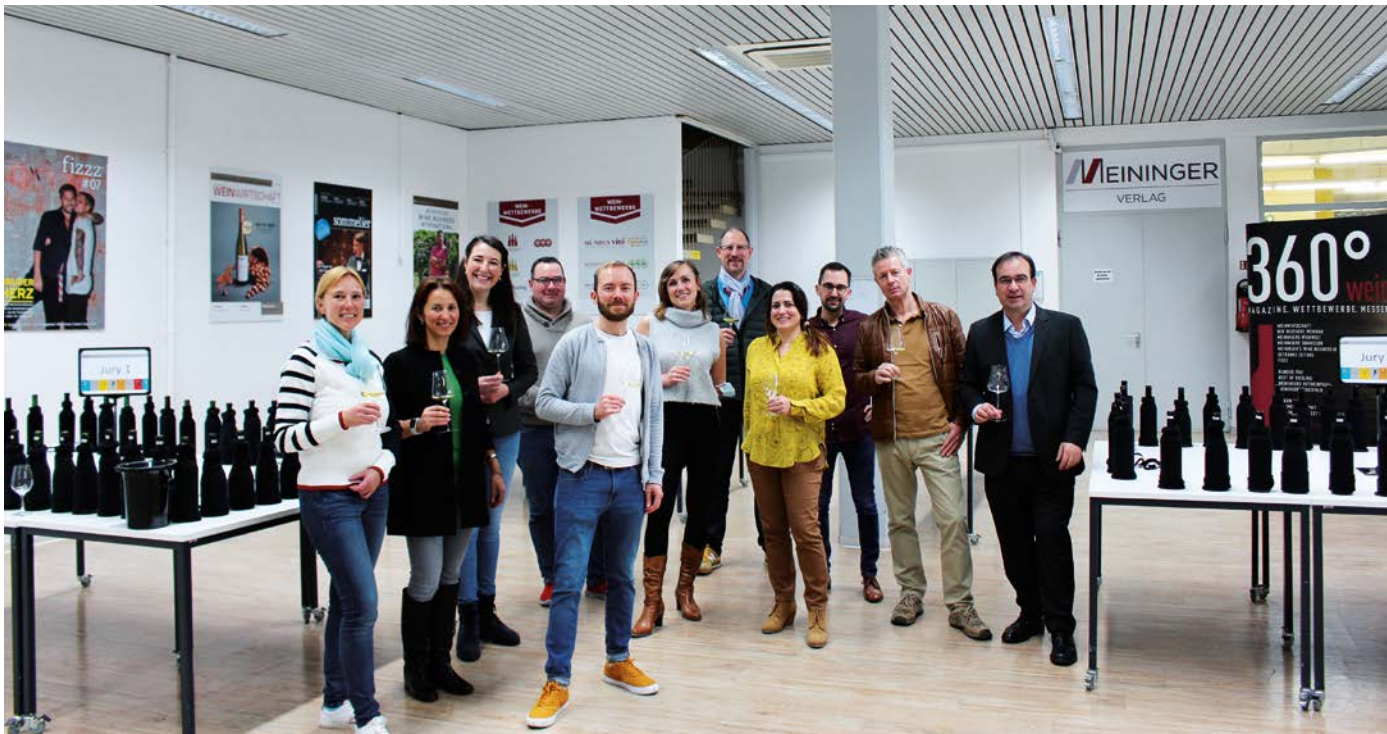
Experienced jury: the team of Best of Spain 2022 at Meininger Verlag

Two intense days of tasting, three experienced juries, almost 300 wines, and the full spectrum of styles: the tasting Best of Spain 2022 offers everything you should taste and know regarding the status quo of the Spanish wine scene.