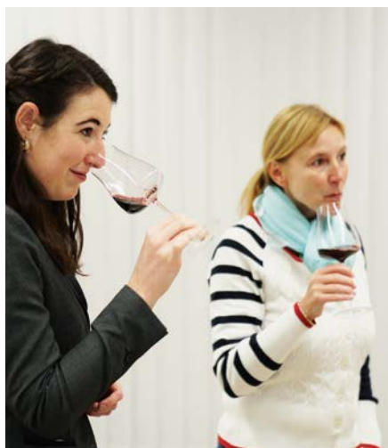
Roughly 75% of the tasting were reds ...

should not neglect the rosé wines: Bodegas Pinna Fidelis's oak-fermented Rosado from 2019 proved that this traditional style yields high-class, serious wines that function as brilliant food companions. Andalucía contributes an invaluable unique selling point for Spanish wine culture, demonstrating this with superb sherries in our tasting, both from biological and