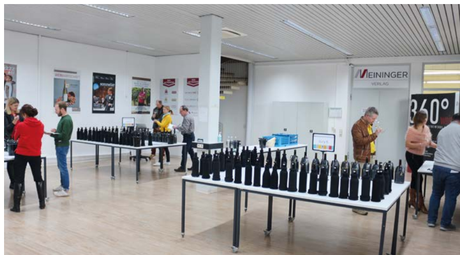
... but sparkling, white wines and Sherry also demonstrated the versatility of Spain