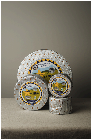
QUESOS LA PERAL LA PERAL, ILLAS, ASTURIAS