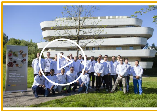
2019 EDITION (video)